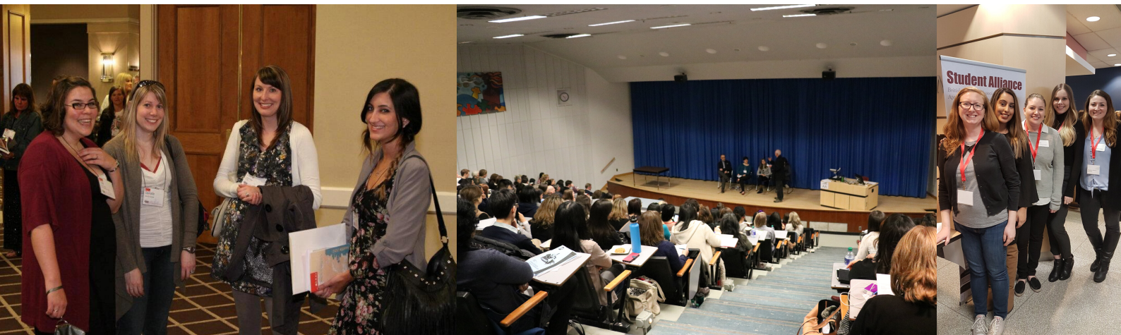
British Columbia Association for Behaviour Analysis